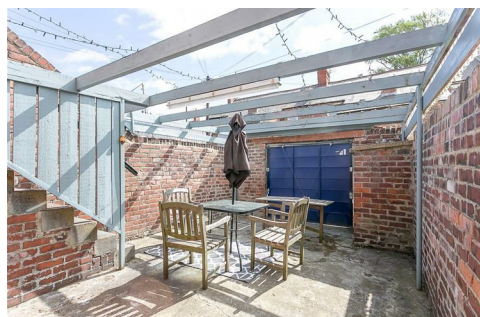
GROUND FLOOR 40.94 sq. ft. (3.7 sq. m.) approx.